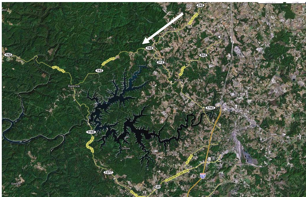
Figure 2: PTA operation area/PTA COA defined Airspace